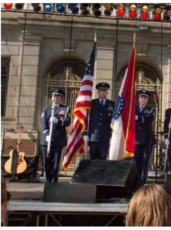
The Honor Guard from the 139th AW presenting accompanied by local musicians during Aug. 17, 2014.