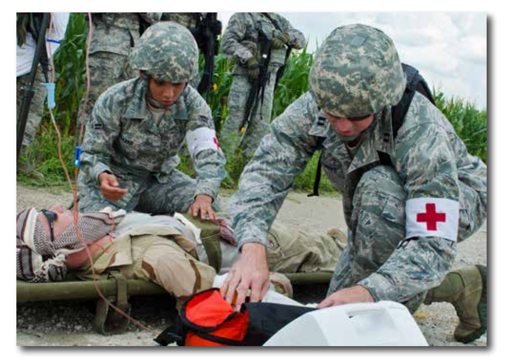
U.S. Airmen assigned to the Missouri Air National Guard's 139th Medical Group simulate patient treatment during a training exercise at Rosecrans Air National Guard Base, Mo.

The 139th Medical Group (MDG) continues to perform the vital mission of providing pre and post deployment force protection and medical evaluation for our deployers. In addition, the medical group provides annual medical, dental and immunization requirements for the all wing personnel, including the Active Duty and Air Reserve members attached to the wing. In this capacity, the 139th AW consistently maintains one of the highest percentages of compliance for dental and immunization readiness in the Air National Guard. The Public Health (PH) and Bioenvironmental Engineering (BEE) sections continue to provide a medically safe and environmentally friendly workplace. Both areas consistently meet and exceed all regulatory and inspection requirements.