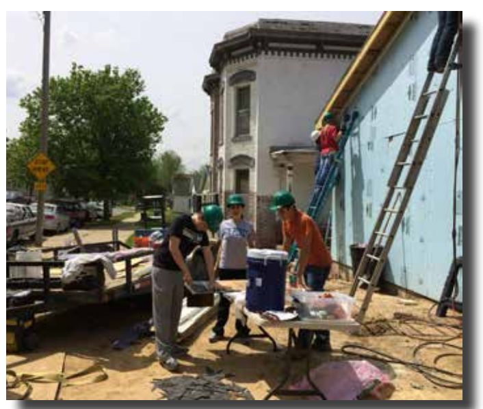
Airmen from the 139th Civil Engineer Squadron, volunteer to help build a house for Habitat for Humanity, May 17, 2014.