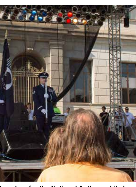
ts colors for the National Anthem while bethe Trails West Festival in St. Joseph Mo.