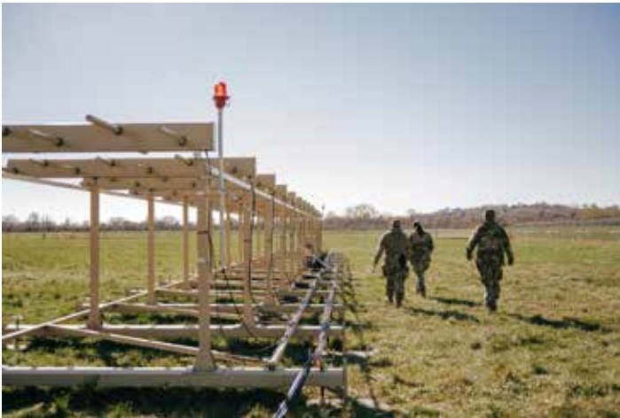
The 241st set up and maintain the newly-constructed TRN-50 Deployable Instrument Landing System (D-ILS) at Rosecrans Nov. 7, 2024.

The 241 ATCS tackled numerous challenges in 2024. From safeguarding Missouri citizens operating in the National Aerospace System, multiple MAJCOM inspections, equipment replacement, enabling the operational testing and evaluation (OT&E) and modernization of a new deployable air traffic control approach landing systems (DATCALs) equipment, and multiple exercises, the unit's tenacity to persevere is always on display.