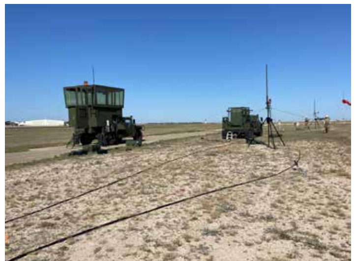
The 241st took their mobile tower to Laughlin Air Force Base, Texas, on two separate occasions.

In March, the unit was inspected by both Air Mobility Command and National Guard Bureau encompassing the Unit Effectiveness Inspection and Airfield Operations Compliance Verification where the men and women obtained an "EFFECTIVE" rating from both inspecting agencies. The men and women traveled to various exercises CONUS and overseas locations supporting PACOM, EUCOM and NORTHCOM requirements with air traffic control, logistics and administrative services. Due to reconstruction of two runway supervisory units at Laughlin Air Force Base, the unit deployed the MSN-7 mobile tower on two different occasions via C-130. These efforts afforded the 47th Flying Training Wing to continue its Undergraduate Pilot Training mission and enabled the $900K construction project, 4,600 sorties and the graduation of 60 pilots. Lastly, supporting Air Force Flight Standards Agency, we are sustaining the OT&E of THALES light deployable instrument landing system with the unit's localizer, site survey and maintenance capabilities.