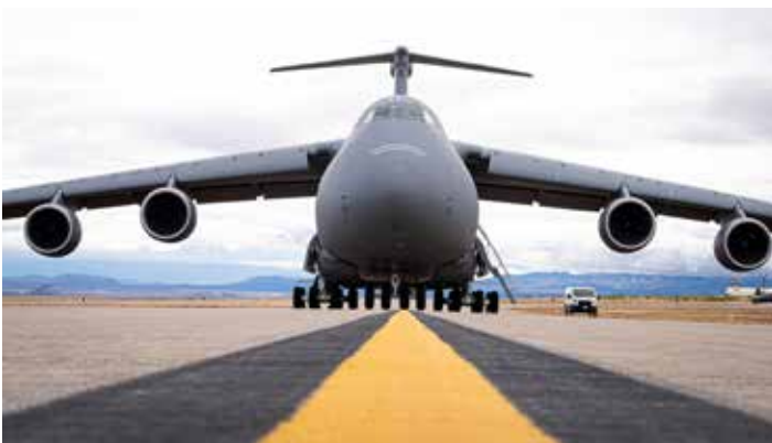
A U.S. Air Force C-5M Super Galaxy assigned to the 22nd Airlift Squadron, sets on the flight line at Fort Huachuca, Arizona, January 23, 2024.

The AATTC is again answering the call and working to train the MAF fleet by developing and facilitating the historic Mobility Datalink Users Course. This course will instruct all Mobility Datalink Users and Support Personnel on how to connect and employ Datalink in accordance with AMC directives. The initial business model is heavily based on MTT's and later will transition into fly-in's to be held at AATTC's primary location in St. Joseph, Mo. Eventually simulator-based training will be the standard, as procurement efforts are proving fruitful, and state-of-the-art hardware will soon be available to our instructors. We also train munitions Airmen at AATTC. We have revived the Weapons Task Qualification Managers Course (WTQM) as a regional MTT course created by our munitions subject matter experts to ensure that Mobility Munitions professionals become experts in flare and chaff loading and usage.