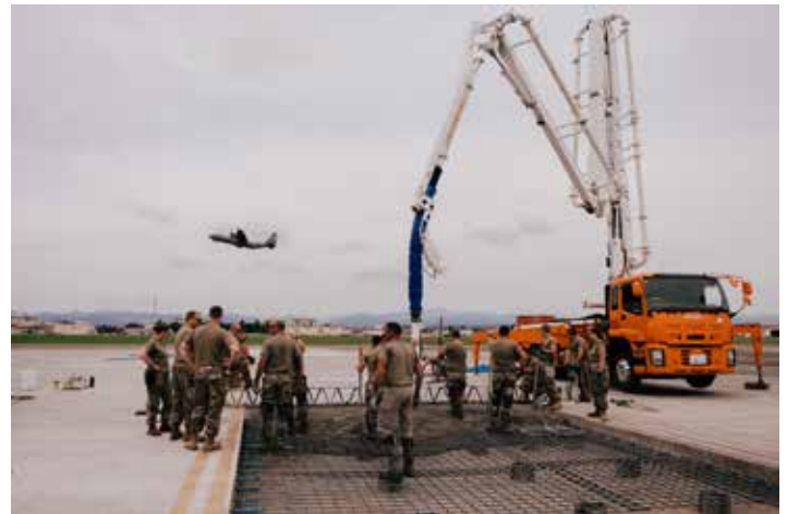
CE Airmen lay concrete at Yokota Air Base, Japan on June 10, 2024. The project extended the ramp to accommodate 10 C-130J Hercules aircraft.

Throughout the DFT, our Emergency Management (EM) section professionally showcased our capabilities, not only with tenant 374th CES/CEX and duration staff from Minnesota's 133rd CES/CEX personnel but also with the Japan Ground Self Defense Force – Nuclear, Biological, and Chemical First Division. The EM team achieved a significant training milestone, completing 84 PTP tasks, delivered CBRN Defense Training, and conducted a thorough CBRN Defense Plan Review. The 139th Fire Emergency Services (FES) completed a range of training exercises, including structural live fire drills, high-rise rope rescue operations, active shooter hostile environment response (ASHER), advanced vehicle extrication, and confined space rescue techniques. The team also had the opportunity to integrate with the tenant 374th CES/FES, further