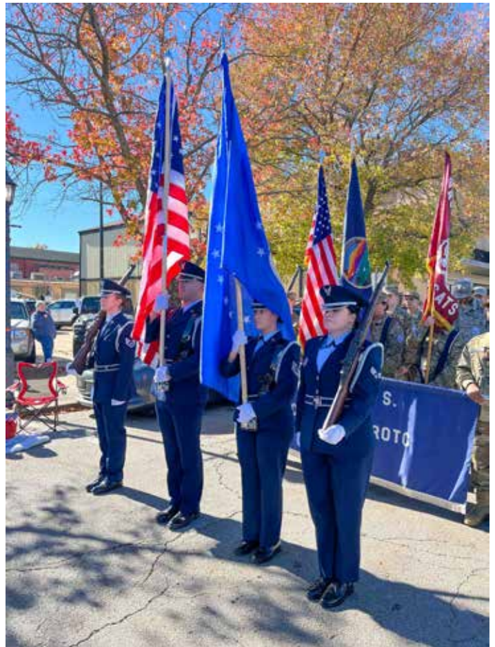
Airmen from the 139th Honor Guard walk in the Leavenworth County Veterans Day Parade on November 11, 2024, in Leavenworth, Kansas.