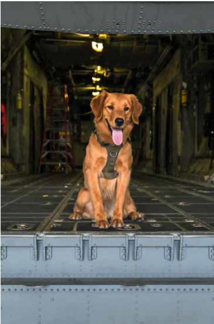
Koda, the 139th Airlift Wing's support dog, sits in the back of a C-130 Hercules aircraft at Rosecrans on Aug 20, 2024. Koda has boosted Airmen morale and served with the 139th for a year.

The Resiliency Team strategic goals for FY24 were to focus on mission readiness through the four pillars of Comprehensive Airman Fitness: aid in the reduction of emotional battles, promote NGB policies related to resiliency, promote self-empowering personal morals & values, and build resilient Airman by asking the question regularly, "How can I help?" The team continued to work hard at addressing these goals through our monthly Resiliency Center Newsletter "Piece of the Puzzle", through online virtual workshops and discussion groups. We shared articles that focus on the four pillars of CAF, including events