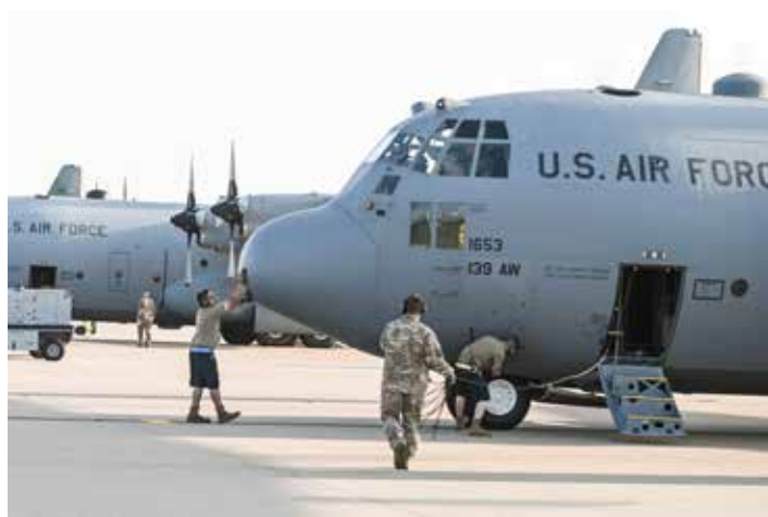
A C-130 Hercules aircraft prepares to take off at Rosecrans Aug. 25, 2024. Airmen and aircraft from the wing deployed to U.S. Africa Command's area of responsibility.