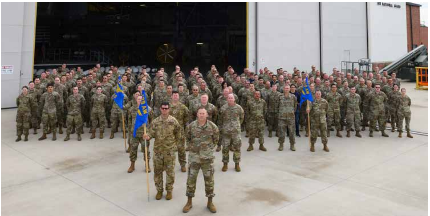
The 139th MXG poses for a photo in front of the Newlon Hangar at Rosecrans on June 9, 2024.

139th Maintainers also faced strenuous challenges in their day-to-day operations. In March, the St. Joseph area was struck with serious hail damage resulting in seven aircraft being rendered non mission capable. To expedite the maintenance process, two depot maintenance engineers arrived on scene within three days to expedite the maintenance process allowing three 139th Maintainers to swiftly map all the dents on each of the aircraft resulting in nearly 6,000 total dents. Across the entire fleet, 12 elevator trim tabs were damaged as well as two elevators- one of