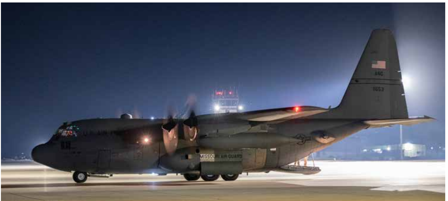
A C-130H Hercules waits to be refueled on Feb. 13, 2024. Aircrews conducted a 41-hour sortie in which the aircraft engines ran continuously for 45 hours and the aircraft was refueled three times.

The 139th Public Affairs team will continue building on this success, embracing innovation, and expanding our reach. We remain committed to showcasing the wing's mission and impact with excellence and engagement.