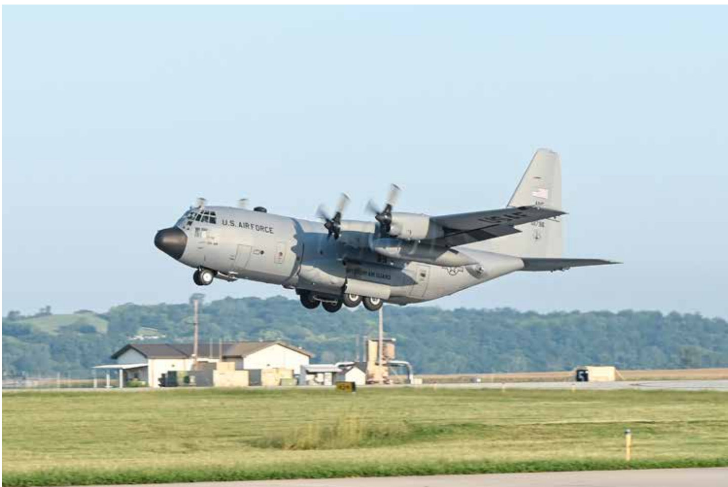
A C-130 Hercules aircraft assigned to the 139th Airlift Wing takes off at Rosecrans Aug. 25, 2024. Airmen and aircraft from the wing deployed to U.S. Africa Command's area of responsibility.