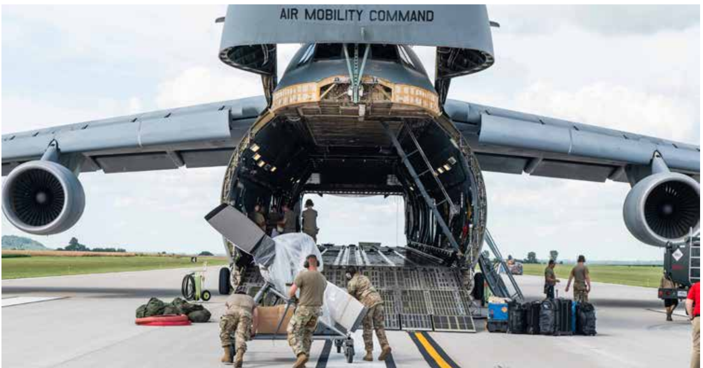
Airmen assigned to the 139th Logistics Readiness Squadron load a C-130 aircraft propeller onto a C-5M Super Galaxy cargo aircraft at Rosecrans Aug. 30, 2024. The C-5 aircraft was used to transport Airmen and equipment from the 139th Airlift Wing for an overseas deployment.

The Petroleum, Oils, and Lubricants (POL) section showcased exceptional resourcefulness and commitment in FY24. Despite a 33% reduction in full-time personnel, the team secured over $333K in facility repairs and maintenance at no cost to the 139th through strategic partnerships. They provided unwavering support, contributing an additional 252 hours to ensure operational readiness across the 139th, AATTC, and WIC. This included crucial support for AEF (STRAT AIR) and AATTC/180th OG exercises. The POL team also played a vital role in the Sound of Speed Airshow, executing 48 refuels and dispensing over 39,000 gallons of Jet A fuel, demonstrating their ability to handle large-scale logistical demands exceeding $157,000. Through efficient resource allocation, steadfast dedication, and proactive