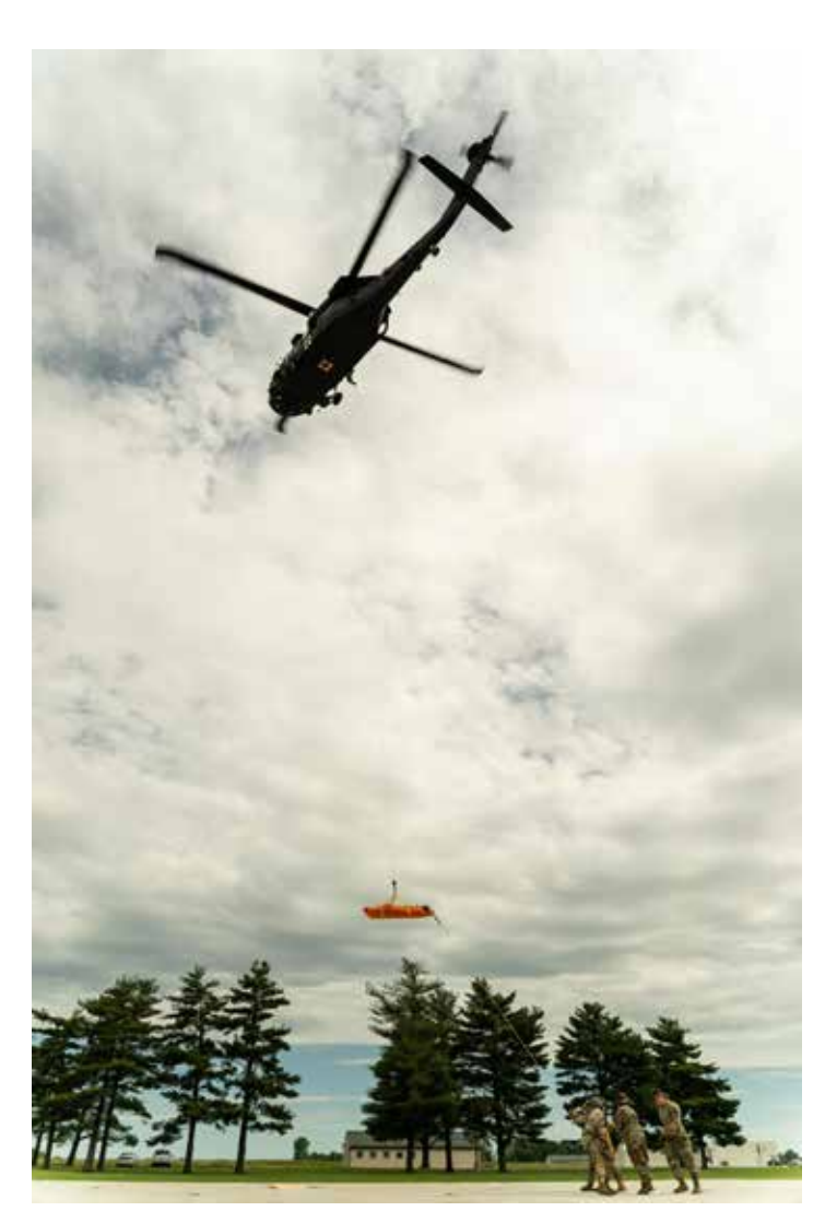
The 139th Medical Group Detachment 1 and the 735th Search and Extraction Recon Team participated in MedEvac training in Nevada, Missouri.

plan. While in attendance of this training two SFS personnel suffered minor injuries including a minor burn on the elbow and a blister on the hand due to improper wearing of gear during shooting exercise. Our 4N0's responded swiftly by assessing the wound, identifying the severity, and the best course of treatment for the personnel to continue training after the injuries occurred