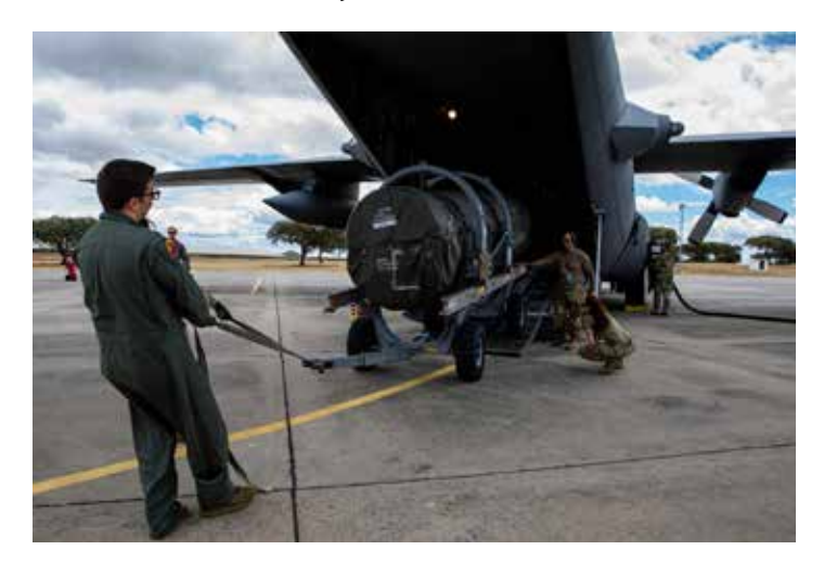
An aircrew from the 139th Airlift Wing stopped by Portugal for an airlift mission for Task Force Iron Herk II.

A C-130 Hercules aircraft assigned to the 139th Airlift Wing sits on the ramp at Ramstein Air Base, Germany, June 28, 2022. The 139th Airlift Wing was the lead unit for Task Force Iron Herk II providing airlift support for European Command's area of responsibility. The Airmen, primarily made up of aircrew and maintainers, were part of a short notice deployment in response to the Ukrainian conflict. Their mission has been to provide C-130 Hercules airlift throughout the region. "The fact that we're here is a show of presence," said Lt. Col. James Pate, commander of Task Force Iron Herk II, who also said his group arrived in the Spring time. "That demonstrates to the world that we can rapidly deploy and execute mobility airlift missions on short notice around the world."