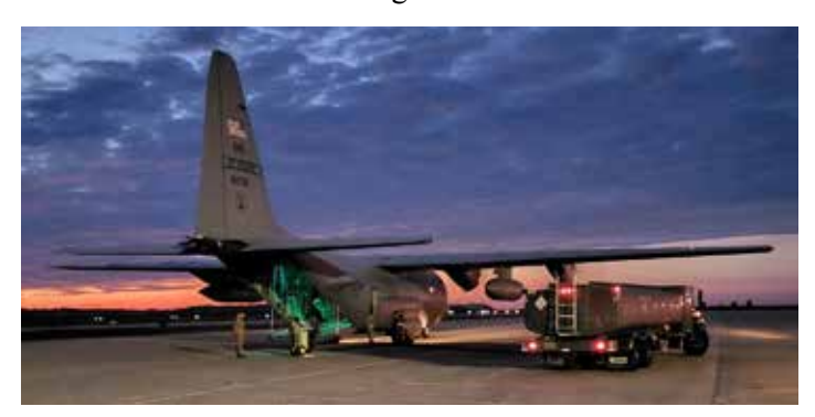
POL performed a 'wet wing' defuel of a C-130 Hercules aircraft for the first time at Rosecrans.

Material Management (MM) continues to aggressively train and standardize processes for the new Airmen and returning deployers. Providing support to three distinct missions is a challenge that is faced head on in MM