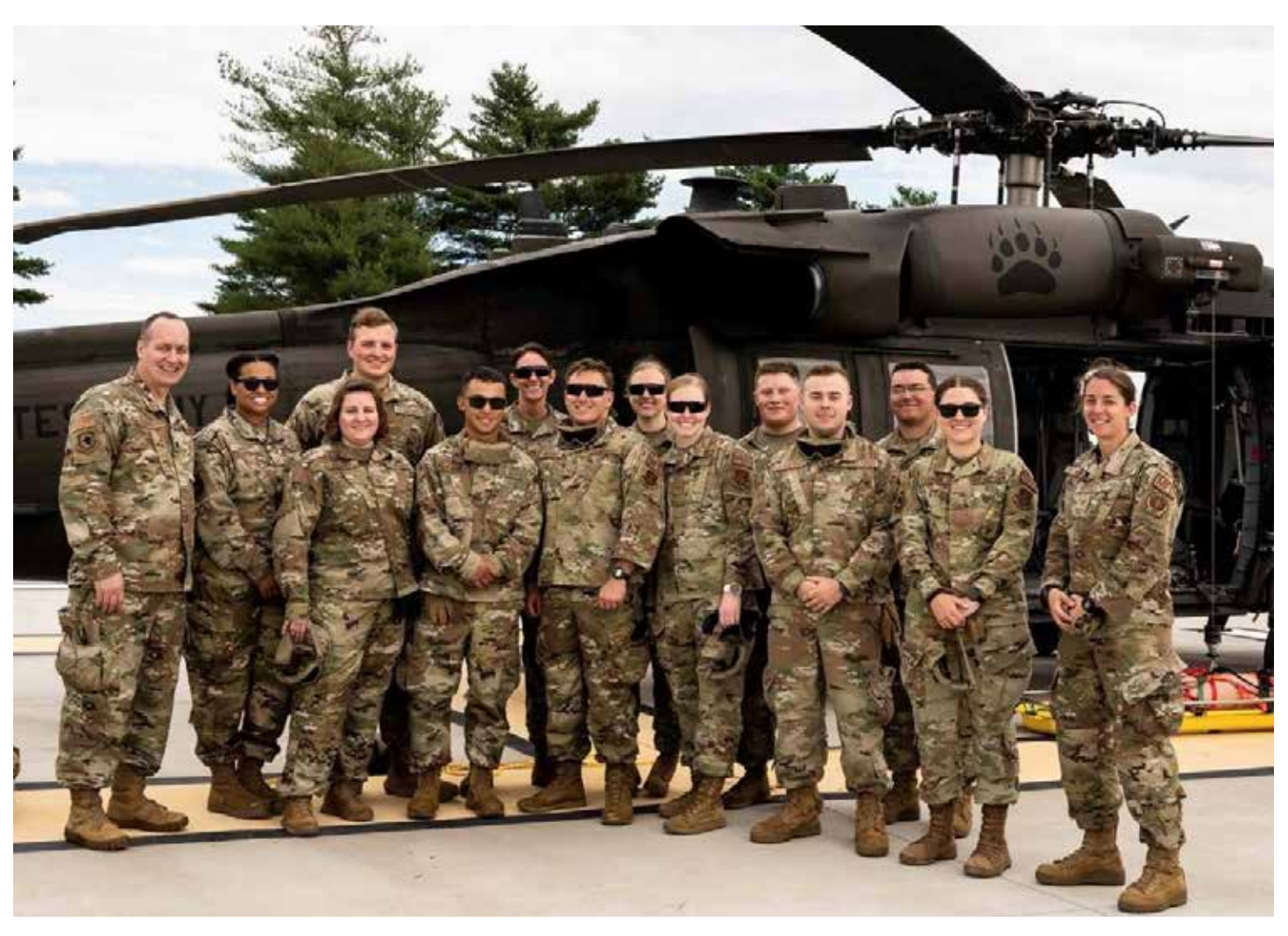
Airmen from the 139th Medical Group Detachment 1 pose for a photo in front of a UH-60 Black Hawk. The Airmen taught Soliders from the MO NG how to prepare patients for airlift.