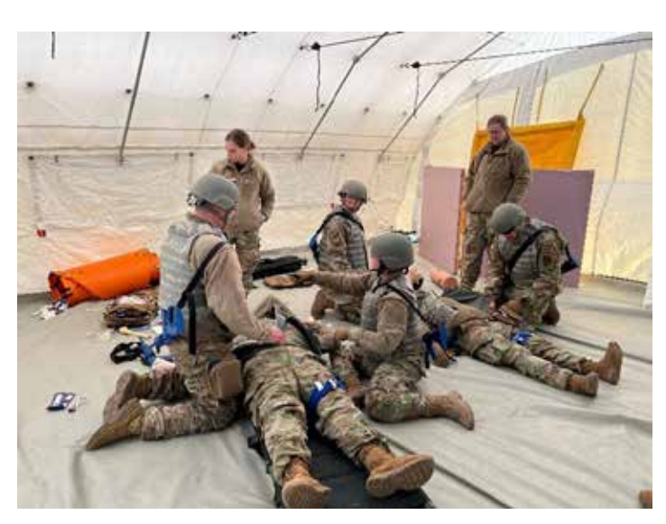
Airmen conduct Tactical Combat Casualty Care.

Two 4N0's from the 139th Medical Group Detachment 1 took part in Security Forces annual training as the range medics. During security forces weapons qualification at Fort Riley, Kansas, these medics were responsible for implementing an emergency transport