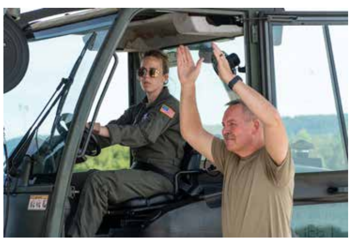
Airmen from the 139th Airlift Wing load a cargo pallet onto a C-130 Hercules aircraft at Ramstein Air Base, Germany, June 28, 2022.