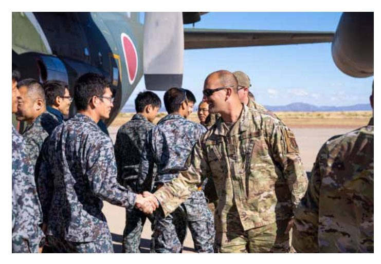
Aircrew from the Japan Air Self-Defense Force attend the Advanced Tactics Aircrew Course in Fort Huachuca, Arizona, Nov. 10, 2022.

In conclusion, the AATTC had begun a significant strategic shift in the year of 2022. With the release of the National Security Strategy and National Defense Strategy 2022, the AATTC is making guidance in those strategic documents to maintain tactical relevance. Our training division is shifting all of our courses emphasizing on components of ACE, Multi Capable Airmen (MCA), INDOPACOM Scenarios,