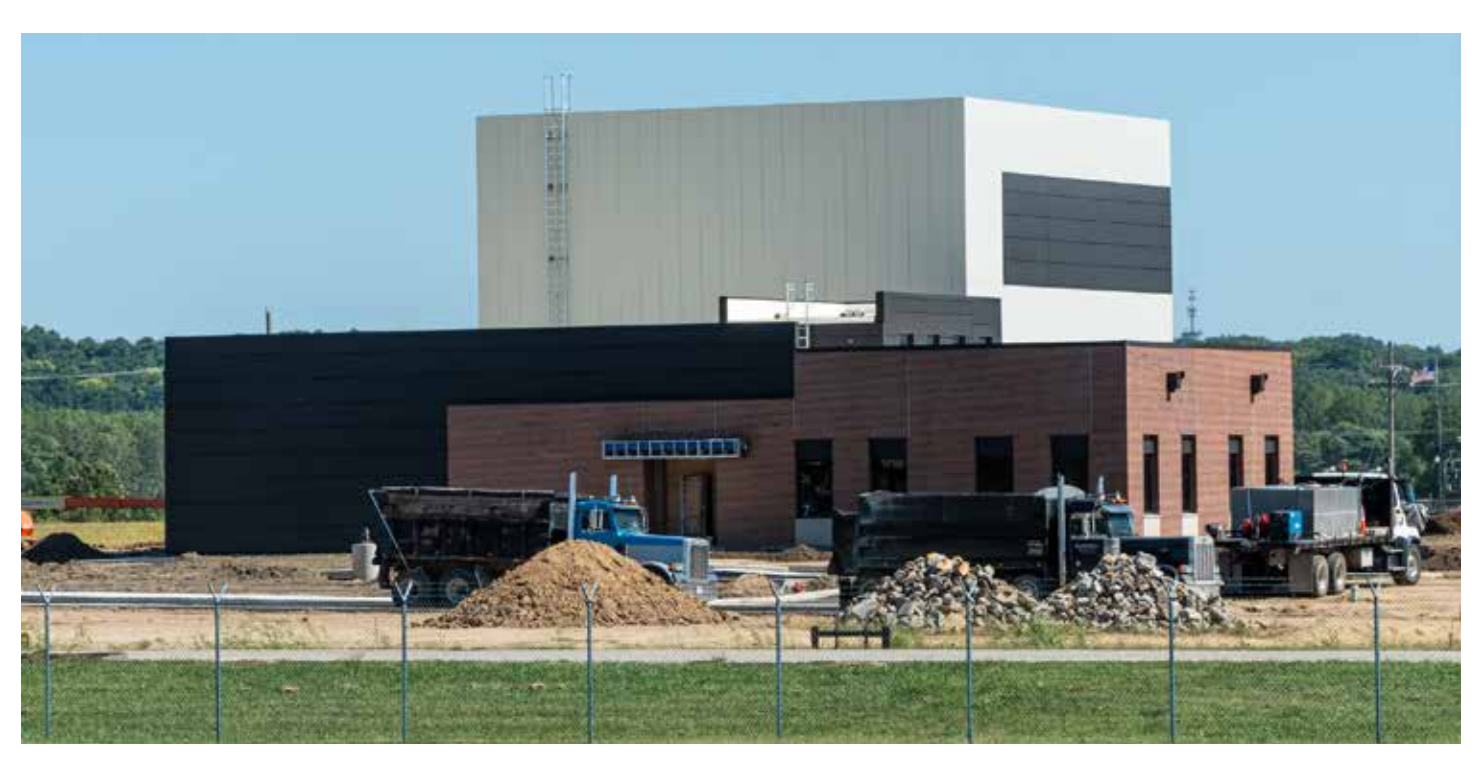
Construction of a C-130 aircraft simulator facility continues at Rosecrans Air National Guard Base, St. Joseph, Missouri, Sept. 20, 2022. Once complete, the facility will house a C-130H aircraft simulator.