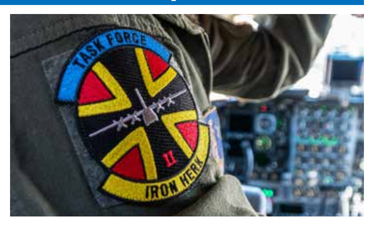
The 139th Airlift Wing was the lead unit for Task Force Iron Herk II providing airlift support for European Command's area of responsibility.

The sections also supported and attended several exercise planning conferences to include Mobility Guardian And Air Defender 23, with plans to attend and participate in each exercise. They also successfully assigned and installed Stratus systems into each aircraft, providing better accountability and