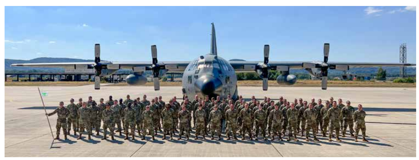
The 139th Maintenance Group deployed to Ramstein Air Base for Task Force Iron Herk.

In January, the 139th generated an aircraft to transport the 241st Air Traffic Control unit to Honolulu, Hawaii for their Annual Training. Additional maintainers were tasked with forming a Maintenance Response Team on short notice to perform emergency repairs and returning that aircraft to fully mission capable.