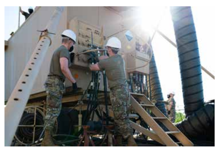
241st Airmen work on a MPN-14K Mobile Ground Approach System in Kapolei, Hawaii.

In July, building 100 site suffered electrical surges damaging computers, phones, and the mobile radar due to a thunderstorm passing through the area. Maintenance personnel worked vigorously replacing indicators, ASR transmitters and receivers, and the communications system brining the equipment back