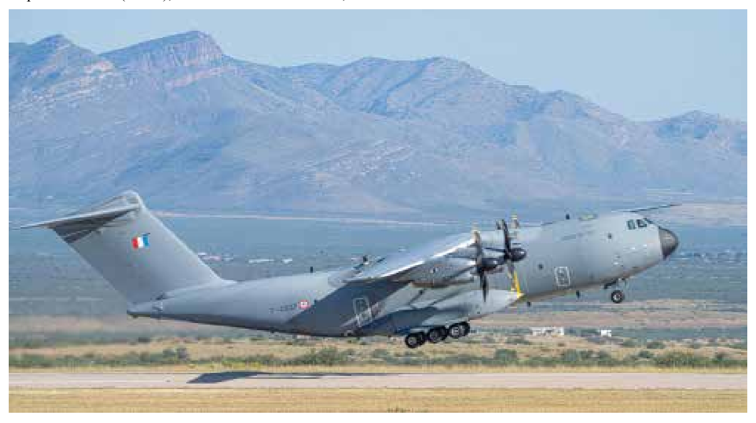
A French Air Force A400M Atlas aircraft takes-off at Fort Huachuca, Arizona, while attending the Advanced Tactics Aircrew Course at the Advanced Airlift Tactics Training Center, Sept. 27, 2022. 28\,

and potential Peer-to-Peer conflict with China. The Development Division and AMC Det 5 are working hard on technologies to aid in training MAF Aircrew to successfully operate in the first island chain of INDOPACOM. The C-130H WIC is also posturing its syllabus to all things ACE. The Mission of the AAT-TC is to "Increase the warfighting effectiveness and survivability of Mobility Forces." In 2022, the AATTC epitomized that mission.