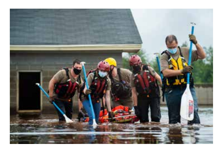
Airmen from the 139th Medical Group complete urban search and rescue training in a flooded environment at the Guardian Centers, Perry, Georgia, Aug. 3, 2021. The Airmen applied life-saving skills in various disaster simulations.

Outside of duty hours, their medical skills were called upon to respond to an Airman having symptoms of COVID-19. While ensuring social distancing and proper personal protective equipment, they were able to safely and effectively treat and transport the Airman to the nearest medical treatment facility. By taking the appropriate quarantine measures directly from 139th AW Pandemic Operations Plan, these Airmen were able to mitigate risk and successfully fulfill the needs security forces mission.