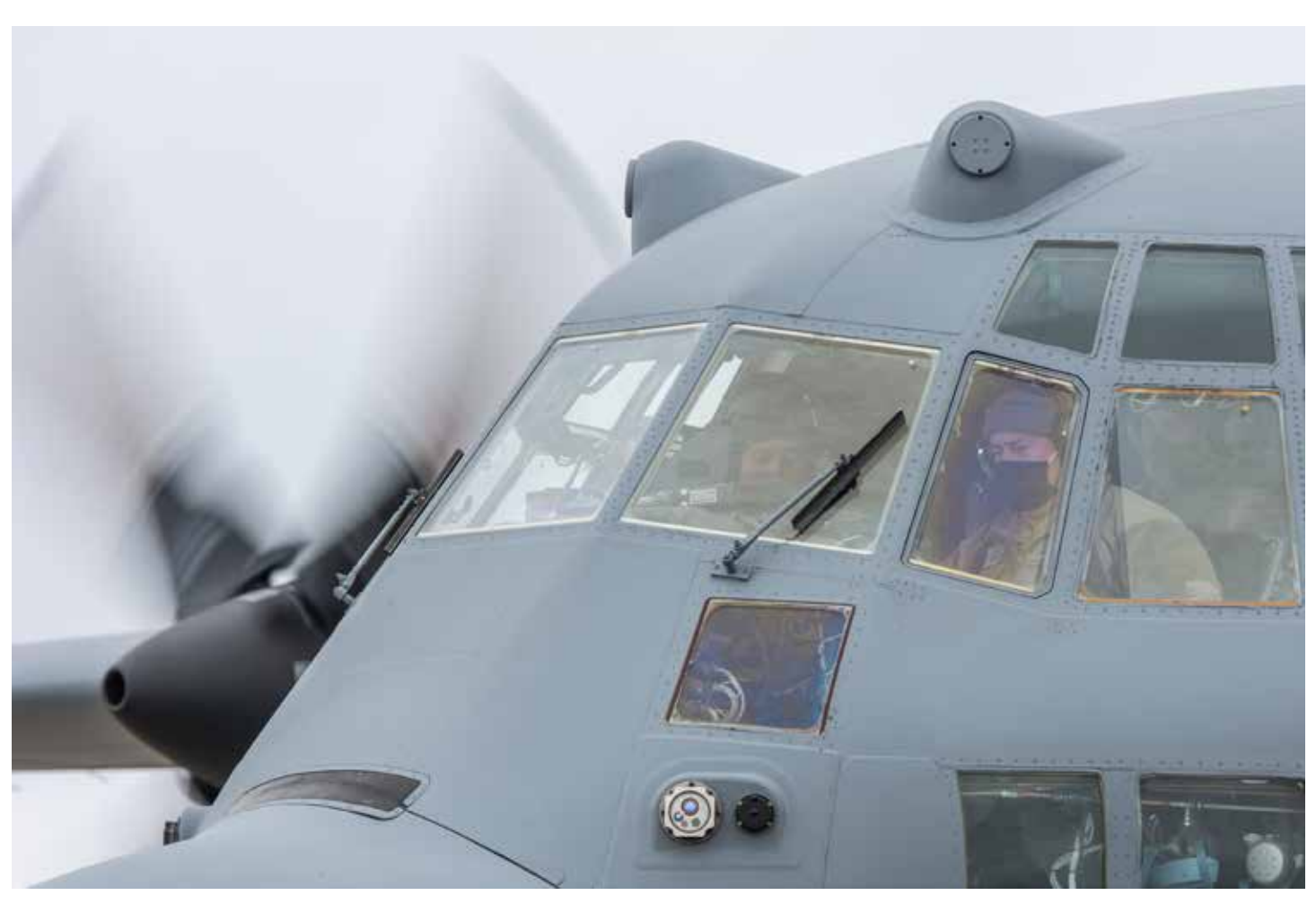
Crew chiefs from the 139th Maintenance Group perform a pre-flight inspection at Rosecrans.