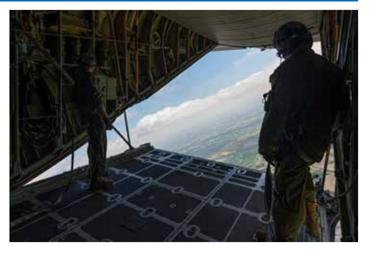
Loadmasters look out the back end of a C-130 Hercules aircraft during the practice run of the Sound of Speed Airshow at Rosecrans.

Airdropped 123 personnel and multiple LCLA