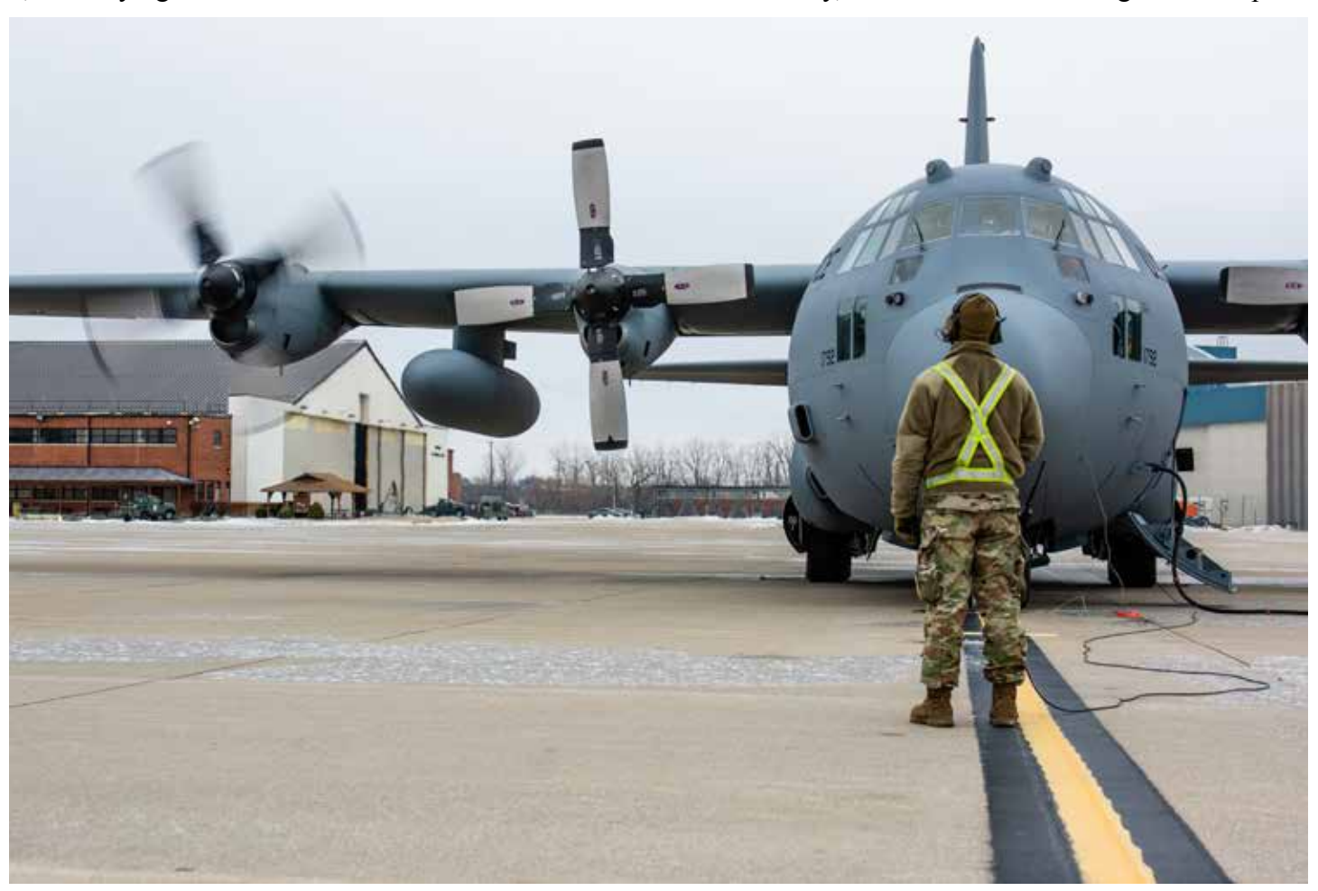
A crew chief from the 139th Maintenance Group performs a pre-flight inspection at Rosecrans Air National Guard Base, St. Joseph, Missouri on Jan. 16, 2021. Airmen routinely perform pre-flight inspections before take off.

In January, members worked throughout multiple