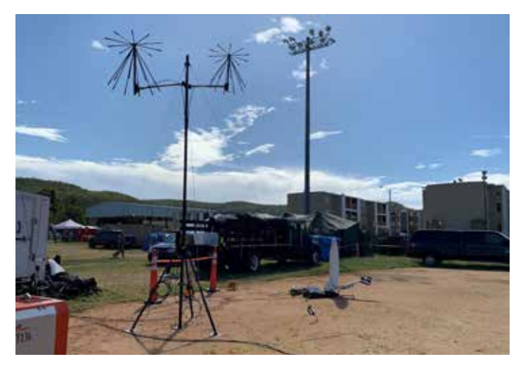
Example of a JISCC in action.

May brought an exciting event to back to Rosecrans as we hosted the SOUND of SPEED Airshow. Though these events are a great opportunity to exhibit the Air Force capabilities and the hospitality of the 139th Airlift Wing, they do not happen without extensive planning and preparation. Communications was tasked this year to assist with vendors during setup. Our radio shop personnel worked diligently coordinating radio communications interoperability between numerous state and federal agencies. In addition to the exceptional support to the Sound of Speed Airshow, the radio shop also programmed and issued 60 Harris quad band LMR radios integrating with the Buchanan County, Missouri Statewide