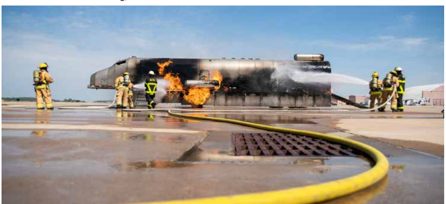
Firefighters assigned to the 139th Fire Emergency Services battle a simulated aircraft fire on a mobile training plane at Rosecrans. This mobile training tool is facilitated by a joint partnership between the Department of Transportation, Federal Aviation Administration, and the University of Missouri's Fire and Rescue Training Institute who brought the training plane to St. Joseph.

The 139 AW Inspector General office is committed to maintain a culture of consistent, continual compliance. Our inspection battle rhythm covers mission assurance exercises, vertical, and By-Law inspections to ensure compliance and learn ways to improve. We will continue to keep the Wing ready to answer the call of our state and our nation. And finally we will be the on the leading edge for the MAF community.