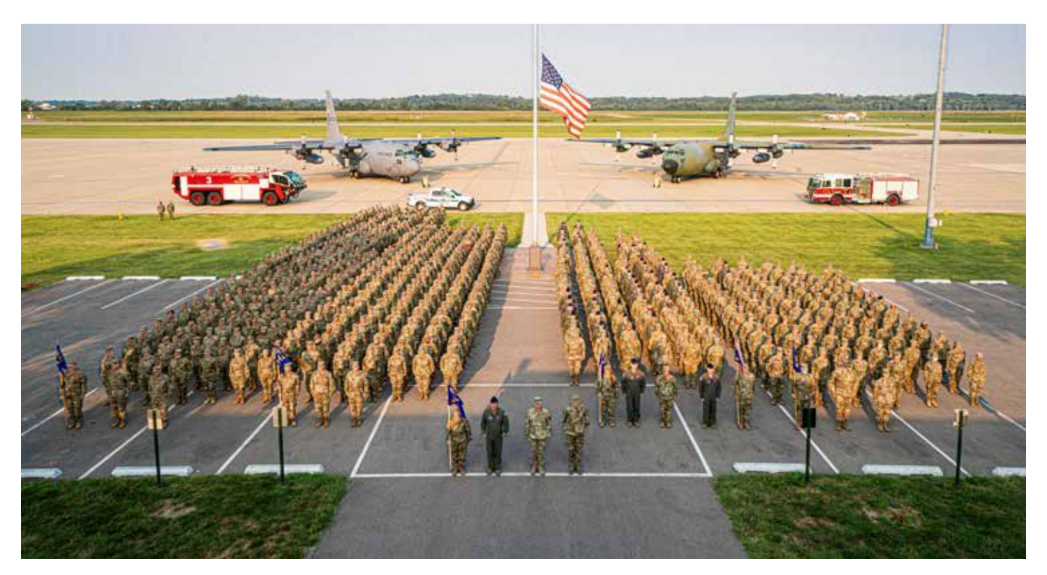
Airmen with the 139th Airlift Wing, Missouri Air National Guard, gathered in formation for a moment of silence at Rosecrans Air National Guard Base, in St. Joseph, Missouri, Sep. 11, 2021, to remember and reflect on the 9/11 terrorist attacks that occurred 20 years ago. 2,996 people lost their lives from terrorist attacks on Sept. 11, 2001.