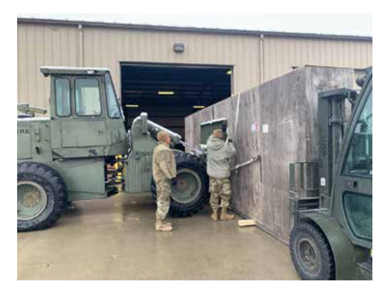
TMO received a replacement vertical stabilizer for a C-130 Hercules aircraft.

During FY21, the Logistics Plans (LP) office was essential in completing virtual in-processing for 214 502(f) members supporting COVID missions throughout the state. Coordination was made for an additional 8 members to continue to support the COVID mission through the end of CY21. The LP office attended a total of 39 IDO call-ins with the total force weekly pertaining to COVID planning, FHP Policy updates, deployment processing updates in a COVID environment, APOE and Aggregation Installation Changes due to COVID and vaccination requirements. LP also deployed and returned 53 deployers from Silver Arrow. FY21 has brought preparation for RCP 07. LP is finalizing plans for the upcoming RCP, which consists of approximately 120 members. In July and August, LP attended readiness exercise planning meetings and will continue to assist in the planning efforts for a successful exercise. In August, LP began assisting with Operation Allied Refuge (OAR) that transitioned to Operation Allied Welcome and (OAW).