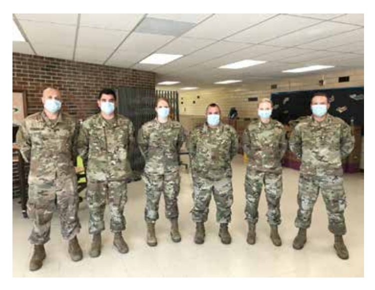
FSS Airmen supporting a food bank mission at Second Harvest.

civilian first responders. Additionally, FSS members supported hospitality requirements for community leaders and all airshow performers by managing over