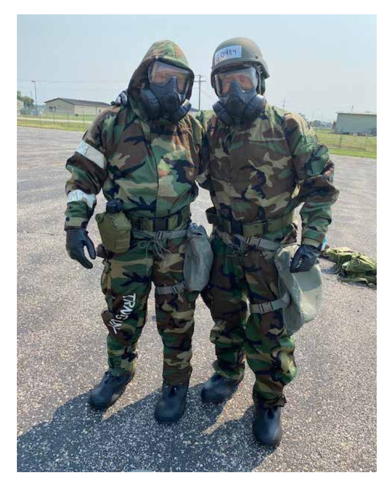
Airmen don chemical protective gear during a training exercise.

The 139th Civil Engineer Squadron looks forward to taking on another challenging year in FY22 and with this group of individuals, this RCP will be fully supported and well represented with the best of what we do and who we are.