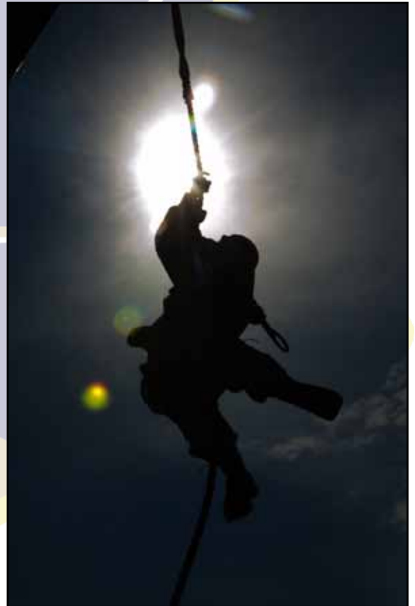
Sixteen Junior ROTC raider teams from across the region competed in the 6th Annual Raider Challenge.