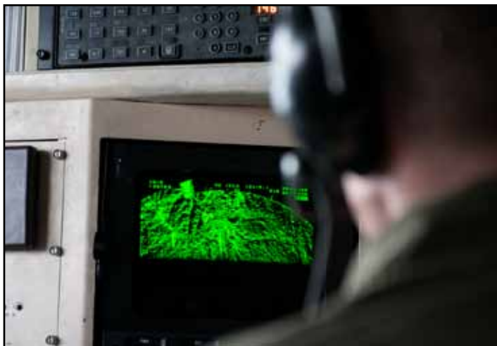
An Airman looks at a radar aboard a C-130.