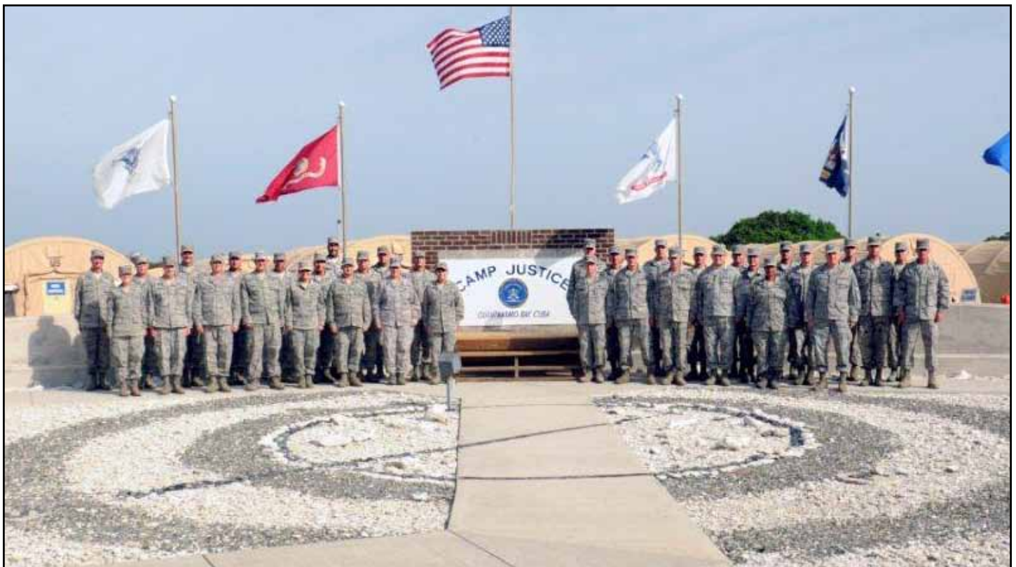
Members of the 139th Civil Engineer Squadron deployed to Guantanamo Bay, Cuba.

One MSG squadron, the Logistics Readiness Squadron, had huge undertakings of bus shuttle