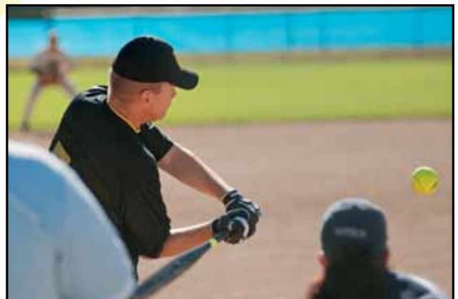
The 139th Airlift Wing hosted the Air National Guard Softball Tournament.