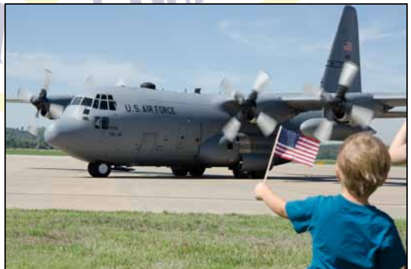
Members from the 180th Airlift Squadron returned from deployment in support of Operation Enduring Freedom.