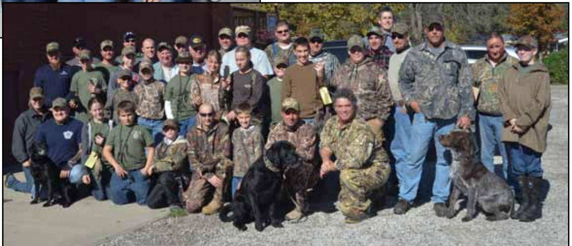
(right) The Missouri Department of Conservation provided an opportunity for children of Guardmembers to participate in a youth duck hunt.