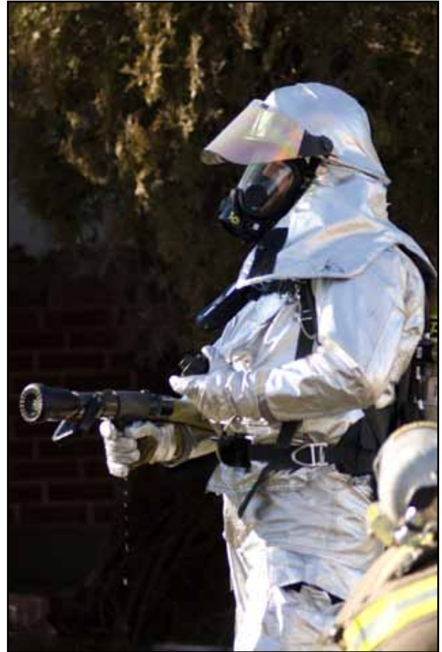
An Airman from the 139th Airlift Wing Fire Department stands by with hose in hand at a residential fire in Elwood, Kan.

MSG elements also supported the completion of a new taxiway, ongoing progress on the new Fire House and renovations in the commander's area of the headquarters building.