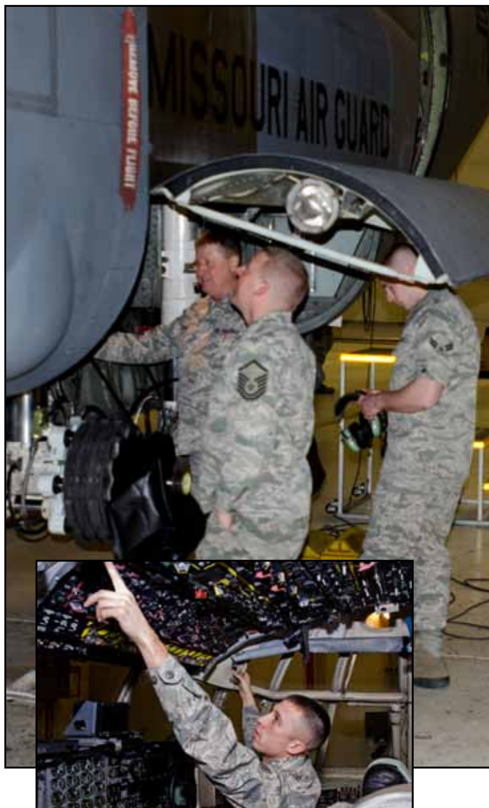
Maintainers perform a major inspection on a C-130 Hercules aircraft in the Newlon Hanger.

We hosted, for the first time ever, the F-22 fighter aircraft during our community open house “Sound of Speed” airshow. Maintenance opened their facilities to support the Raiders Challenge, hosting JROTC teams from the local regional high schools. Raiders Challenge is a weekend long competition pitting teams against each other using physical and mental challenges to hone their leadership skills.