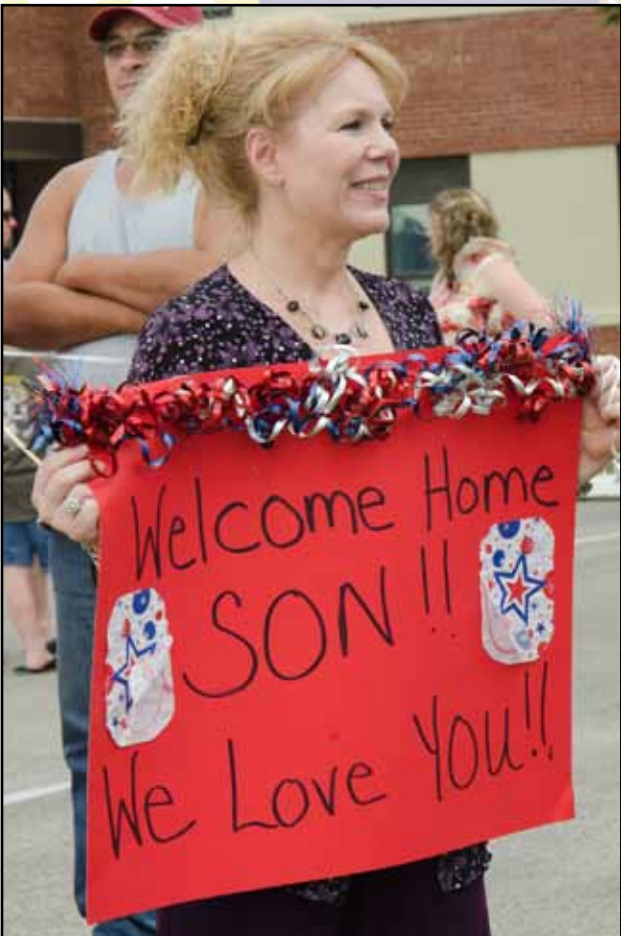
Family members await the arrival of the 139th Civil Engineering Squadron from Guantanamo, Cuba.