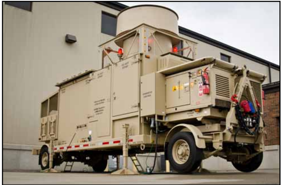
The 241st ATCS acquired a Tactical Air Navigation System (TACAN) in 2012. The TACAN acts as a navigation system for pilots.

The members of the 241st Air Traffic Control Squadron provide worldwide and local air traffic control support for the United States Air Force, the Missouri Air National Guard and Rosecrans Memorial Airport and surrounding airspace. The 241st is one of ten Air Traffic Control (ATC) squadrons in the Air National Guard (ANG), which represents 65% of the Air Force's worldwide air traffic control wartime support. The 241st consists of air traffic controllers, air traffic control and landing systems maintenance, mobile tactical air navigation, supply, logistics and management staff. As part of the Federal Aviation Administration's Federal Contract Tower (FCT) program, the 241st provides daily air traffic tower services at the airport. In addition to the tower, the 241st also provides air traffic radar approach