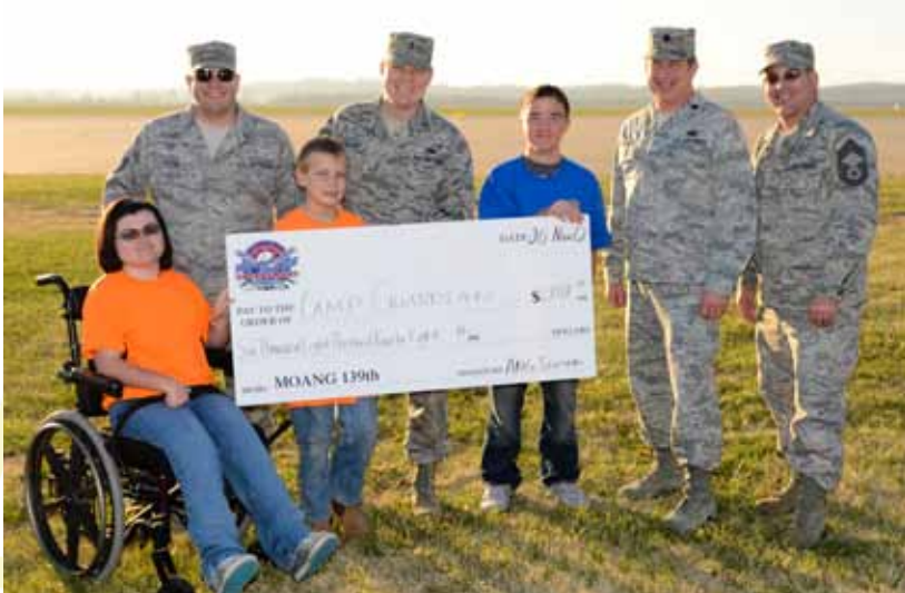
Some of the proceeds raised at this year's ANG softball tournament were donated to Camp Guardian, a special needs camp sponsored by the Missouri National Guard.