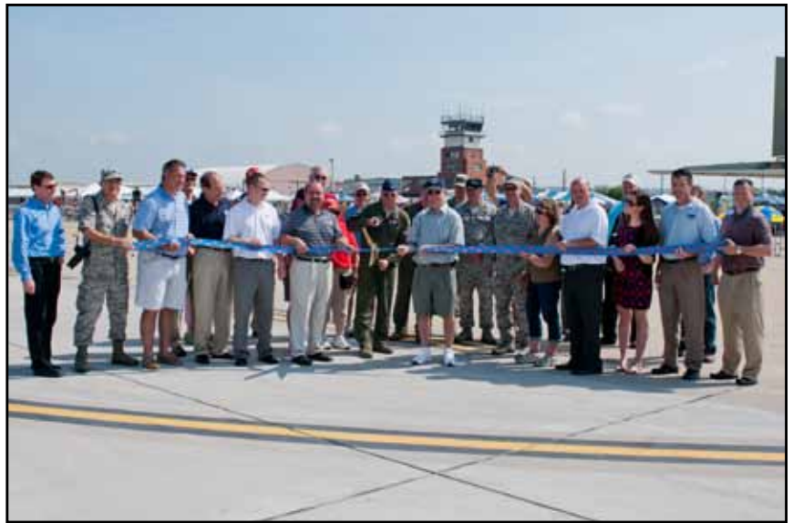
Civic leaders attend the ribbon cutting ceremony for the newly constructed taxiway during the 2012 Sound of Speed Airshow

Construction on the taxiway and a new firehouse have brought many contracting jobs to Rosecrans.