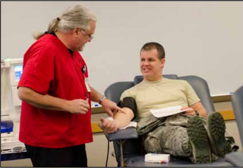
Airmen donate blood to the Red Cross during a drill weekend.