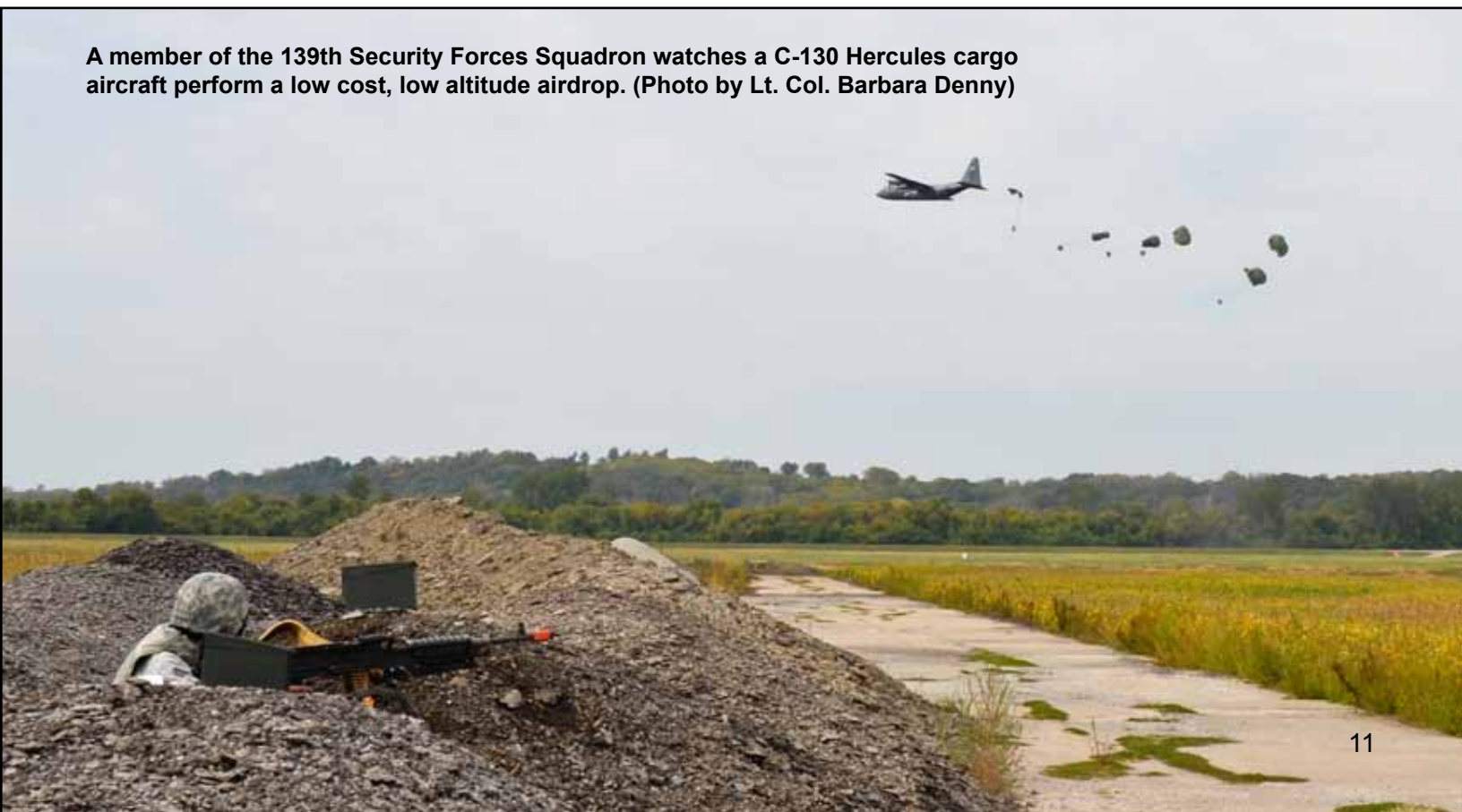
A member of the 139th Security Forces Squadron watches a C-130 Hercules cargo aircraft perform a low cost, low altitude airdrop.

allied countries), 8 Advanced Air Mobility Intelligence Courses (60 students), 4 Mobility Commanders Tactics Courses (50 senior officer/commanders), 3 Combat Aircrew Tactics Studies/Mobility Electronic Officer Courses (120 students), 10 Munitions Qualifications Course (73 students), and one Datalink Managers Course (7 students). Allied support was increased by the addition of the Czech Republic to the AATTC's customer base.