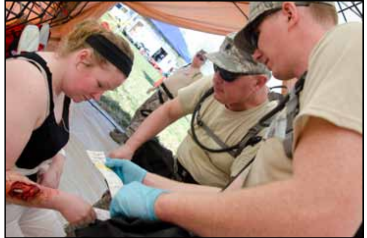
Airmen with 139th Medical Group tend to role-players posing as victims during a Homeland Response Force exercise.

The 139AW is the home of the medical component of the joint service FEMA Region 7 Homeland Response Force (HRF) medical package. The HRF medical team includes 45 doctors and medics assigned to the MDG, and it is one of 10 HRFs within the United States. In 2012, team members successfully completed a joint service team exercise evaluation at the Muscatatuck Urban Training Center in Indiana. Later in the year, 48 Medical Group personnel completed wartime task Expeditionary Medical Support