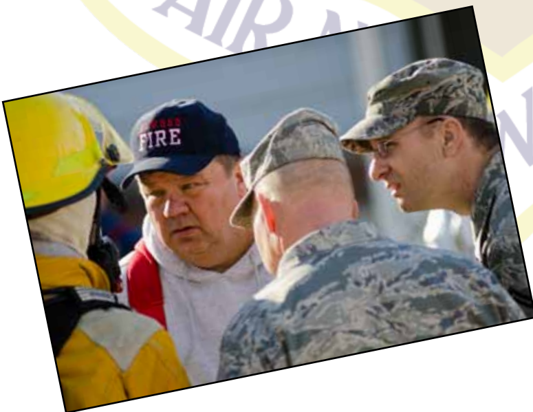
Airmen from Rosecrans Air Guard Base, St. Joseph, Mo., assisted local fire departments with a residential fire.