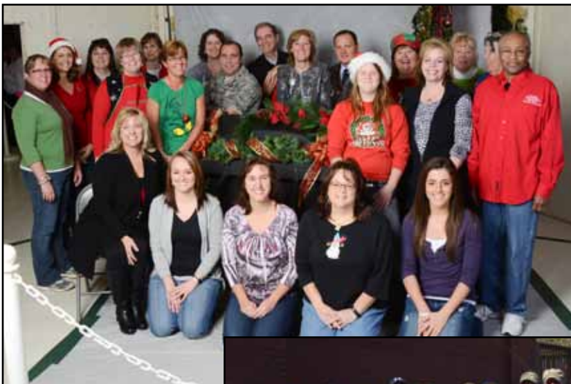
(top) Volunteers pose for a photo at the children’s Christmas workshop.

Airman and Family Readiness contacts and coordination paid big dividends for interested members and their families. A dozen Guard families from the 139th Airlift Wing were invited by the Missouri Department of Conservation to attend a duck hunting clinic for their children. The Department raised more than $1,300 in private donations so the kids could learn to duck hunt.