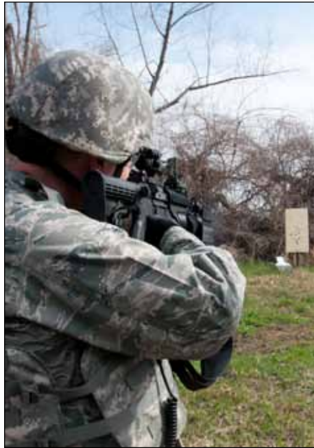
The 139th Security Forces Airmen conduct weapons training before deploying to Iraq.

As we look forward to calendar year 2012, Mission Support Group faces another 179-day deployment for the Civil Engineer Squadron, a May air show and deployment support for the Aviation Package. As always, the men and women of the Mission Support Group will rise to these challenges with the energy and enthusiasm that makes us proud.