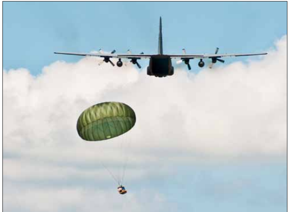
A 139th Airlift Wing Missouri Air National Guard C-130 Hercules cargo aircraft performs an air drop at Rosecrans Air National Guard Base.

The 139th Operations Group provides personnel for world-wide operations, including Operations Joint Enterprise, Coronet Oak, Enduring Freedom and New Dawn while fulfilling state missions such as the Joplin tornado disaster and flood relief.