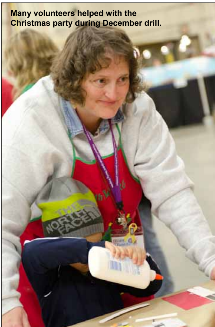
Many volunteers helped with the Christmas party during December drill.