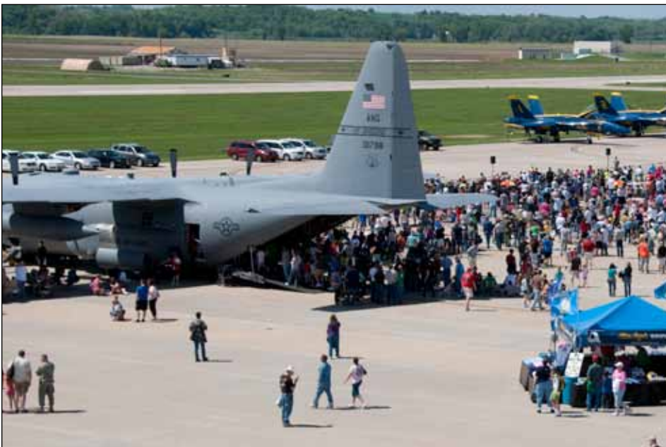
Thousands gathered at the Sound of Speed Air Show in May 2010.

Logistics Readiness Squadron managed the tremendous logistics challenges of an air show to include the management of the trash detail and manpower.