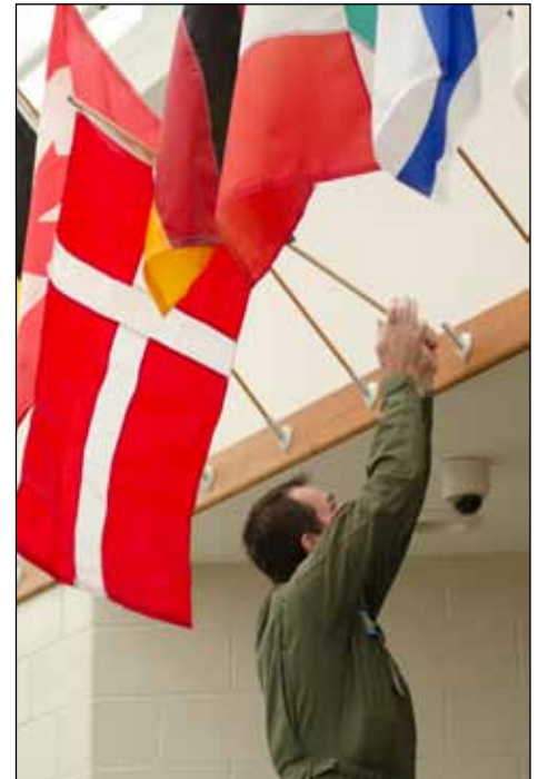
A member of the Royal Danish Air Force hangs their country’s flag in the entrance of the AATTC on Sept. 16, 2011. Each country that has been through the school displays their respective flag.

Implementation of the Total Force Initiative, which placed AMC’s Detachment 5 at St. Joseph, was codified in the rewriting of AMCI 11-207, “AMC’s Weapons and Tactics Program.” The rewrite made AATTC the clearing house for analysis and development of new tactics for the Mobility Air Forces. It caused us to re-focus our intended audiences in our tactics training programs to include aircrew and intelligence working together. The Combat Airman Tactics Course and Mobility Electronic Combat Officer Course were combined into one, two-week course that focuses on what a unit level Tactics Chief and Electronic Combat Officer need to know to accomplish their job.