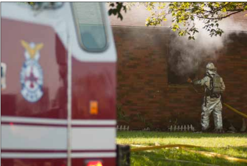
139th firefighters assist in mutual aid with the Doniphan County Volunteer Fire Department August 25, 2011.