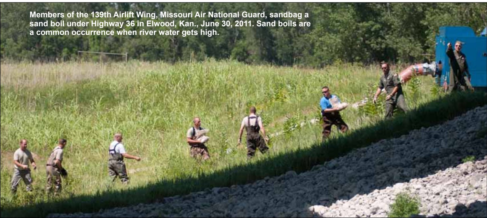
Members of the 139th Airlift Wing, Missouri Air National Guard, sandbag a sand boil under Highway 36 in Elwood, Kan., June 30, 2011. Sand boils are a common occurrence when river water gets high.