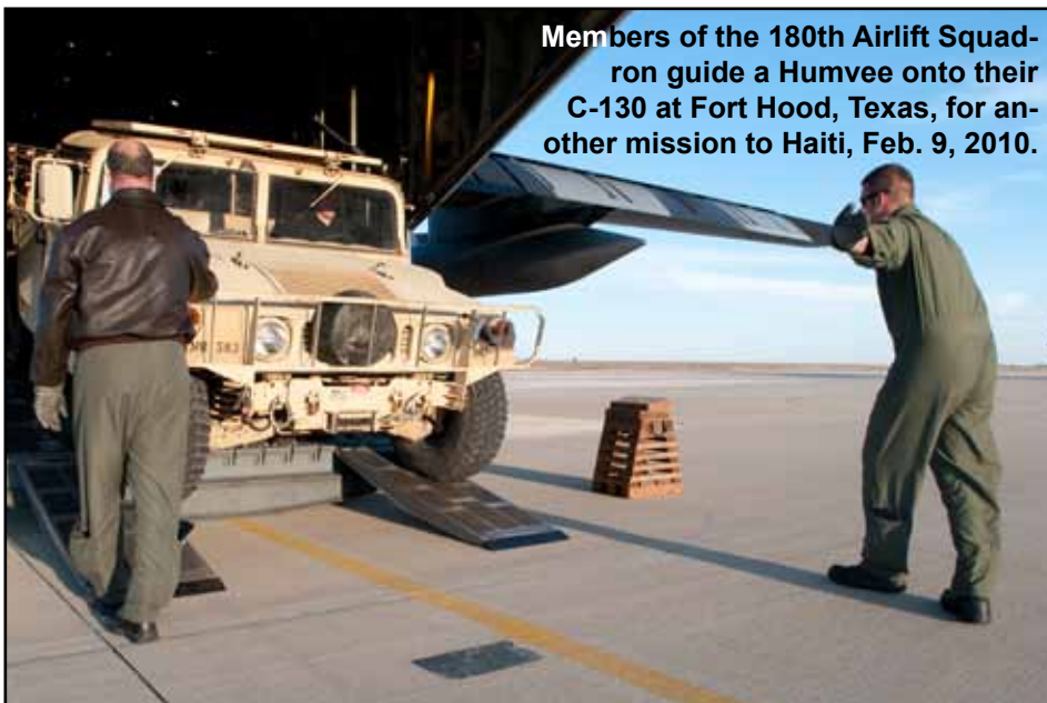
Members of the 180th Airlift Squadron guide a Humvee onto their C-130 at Fort Hood, Texas, for another mission to Haiti, Feb. 9, 2010.

While deployed in support of Operation Coronet Oak, 180th Airlift Squadron and 139th Operations Support Flight Airmen were specifically tasked as one of only two Air Force flying squadrons to deploy and directly support the immediate humanitarian needs in Chile after a devastating 8.8 magnitude earthquake. The 180th flew multiple relief, supply and Aeromedical Evacuation missions March 6-14.