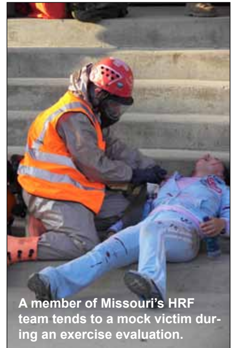
A member of Missouri's HRF team tends to a mock victim during an exercise evaluation.

Triage tents are constructed to facilitate patient care during emergency response exercise.